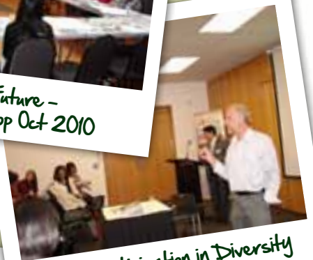
TANI's participation in Diversity Forum