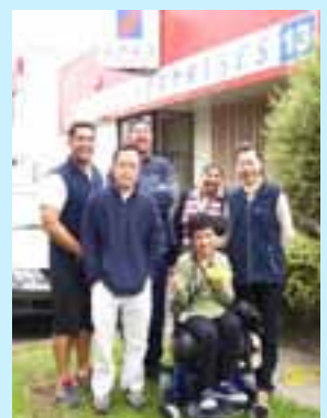
Staff, employees and service users of APET in Papatoetoe.

To learn more about who we are and what we do, please contact any of our staff at 278 1678 ext 203 or visit our office at 11-15 Laureston, Avenue Papatoetoe. You can also check our