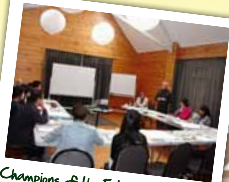
Champions of the Future - Leadership workshop Oct 2010