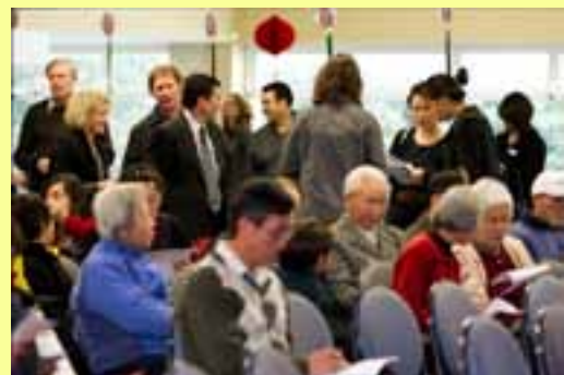
Photograph taken at the Chinese Sport Forum

Networking between cultures/ Publicity of Chinese community in English newspapers to raise awareness/ To learn from other countries about how to develop certain sports/ More promotion through school – Children as messengers for parents and sports/ Create an ethnic section in each sport/ Provide Chinese with opportunity in a greater variety of sports.