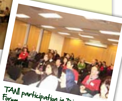
TANI participation in Diversity Forum