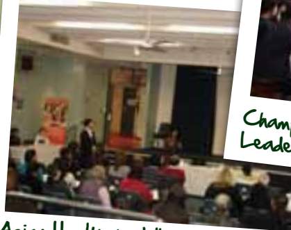
Asian Health & Wellbeing Issues & Challenges, TANI Network Meeting